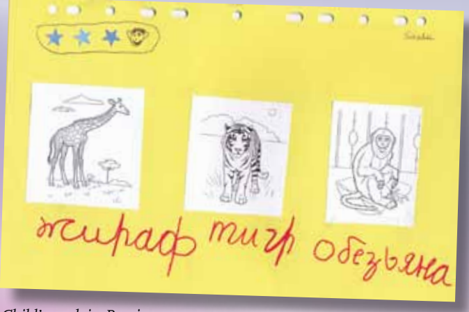
Child's work in Russian

He has changed now that I've seen him in his English school... Now he helps me in Russian school and tells me stories of what he did in the week...He really enjoys learning Russian and thinks it is something "cool".